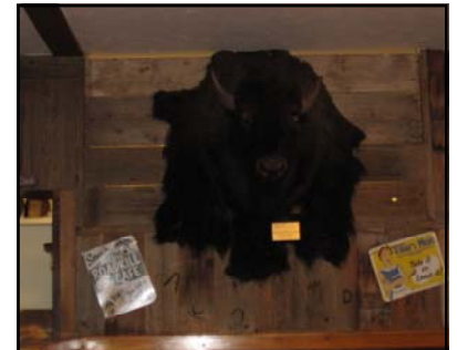
"Bully" the Buffalo