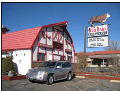
A Montrose Icon

The sisters are ready for the challenge of expanding their business from a seating capacity of 50 to now nearly 200. The addition of a bar area will provide them the chance to add live music venues and a place for locals to watch their favorite sporting action away from the dining customers.