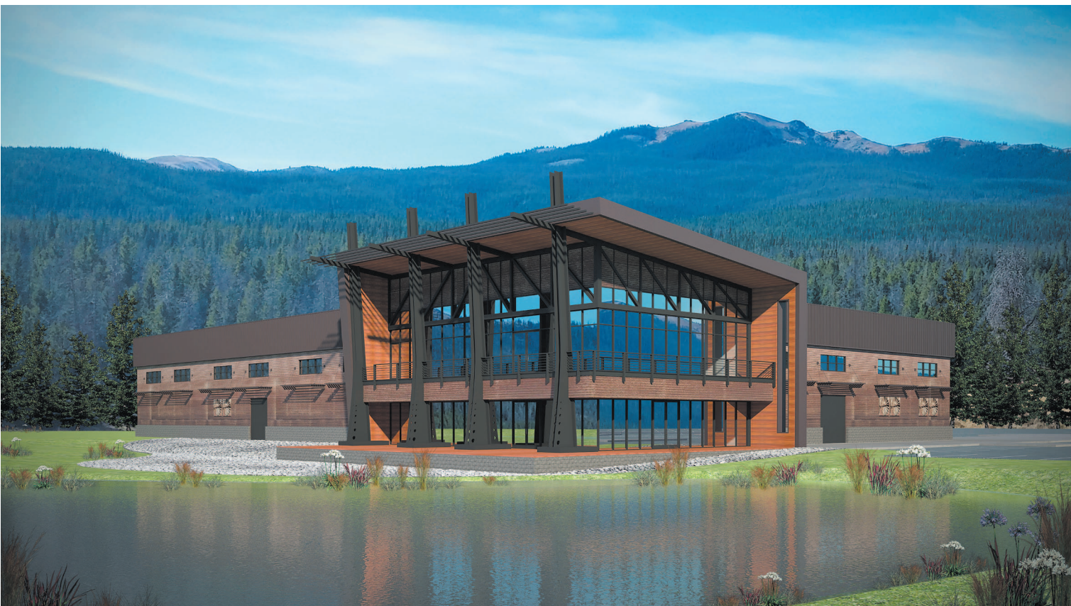
A sample architectural rendering of the planned Abel and Ross headquarters.